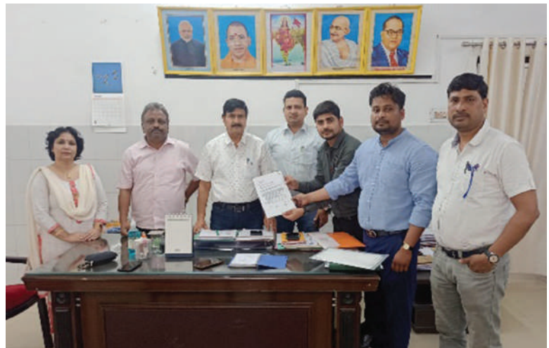
▲ Formal approval granted from CMO and health officials of Districts

The Mobius Foundation is expanding its project Aakar in four high Total fertility Rate (TFR) as districts of Uttar Pradesh (Bharaich, Shravasti, Balrampur, and Siddharthnagar). These areas have also been termed as aspirational districts by NITI Aayog. MF Team has received formal consent from health officials of 3 districts to start their ground activities in identified high priority blocks. We will receive consent letter from District Siddharthnagar very soon.