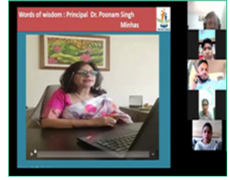
▲ Orientation Program at GAV

An orientation cum introduction programme of teachers, students and parents was conducted on 17th April 2021 which marks a successful beginning of the session 2021 -22. It was conducted by the admission counsellor aimed at familiarizing the students to an unknown Campus environment, its faculty members and infrastructure. Through this they made a bridge by introducing themselves and exchanging their thoughts. Parents got familiarized with the principal, teachers and other staff who can address to their future issues. They got better understanding about the vision and the motto of Gyan Anant Vidyalaya and the Mobius foundation.